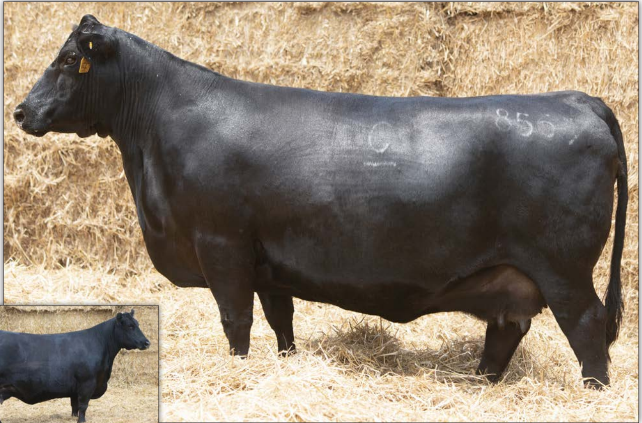
CLARK BLACKBIRD 8567 2572 – Lot 8