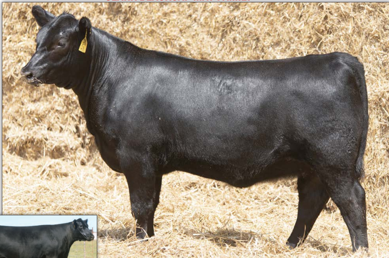
CLARK BLACKCAP MAY 4D3 3503 – Lot 1