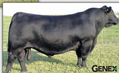
SAV RENOWN 3439 – Full brother to the dam of Lot 1.