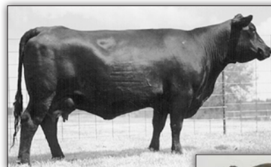
RITO 154 OF IDEAL 6173-174 – Legendary maternal ancestress of Lots 4 and 5.