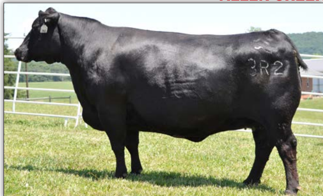
SINCLAIR LADY 3R2 4465 – Pathfinder grandam of Lot 23 and third dam of Lot 24.