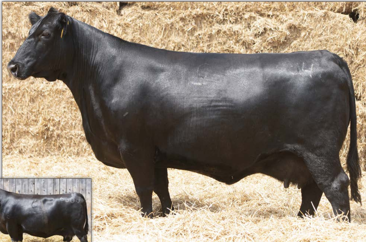
CLARK DONNA 8546 6Y3 – Lot 12