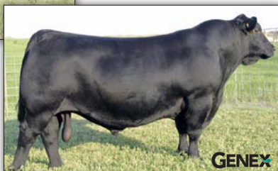
SAV RENOWN 3439 – Featuring daughters of this famous Pathfinder Sire.