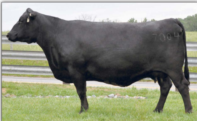
JC LADY 6500 7004 – Maternal sister to the grandam of Lot 9.