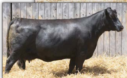
JC ROSE 6518 7008 – Maternal sister to Lot 20.