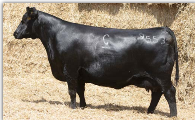
CLARK Q MOTHER 9553 2004 – Maternal sister to the dam of Lot 11.