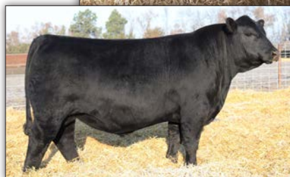
SAV DEXTER 3594 – His first service sells.