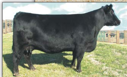
JKS MISS CHEYENNE 196 – Fourth dam of Lot 17.