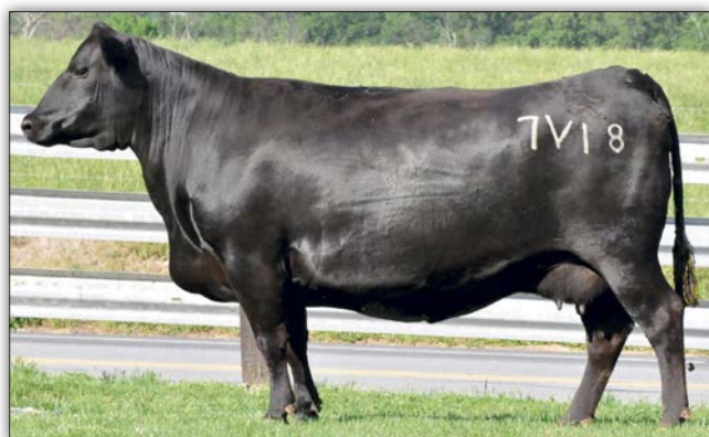
SINCLAIR BLKBIRD 7V18 12F3 – Dam of Lot 27.