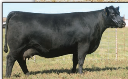
SAV BLACKCAP MAY 3503 – Dam of Lot 1.