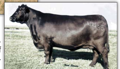
IDEAL 4465 OF 6807 4286 – Maternal ancestress of Lot 9.