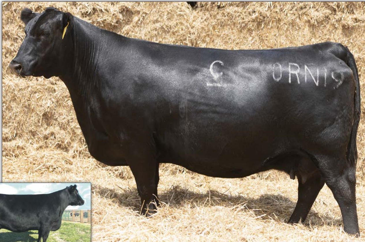
CLARK CHEYENNE ORN19 1527 – Lot 17