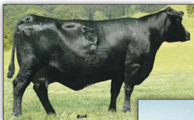
AAR DONNA 1853 – Maternal ancestress of Lots 12 through 16.

AAR NEW TREND – High-maternal Pathfinder Sire from the Donna family.