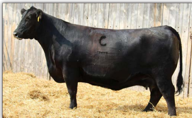
JC DORINDA 7529 0549 – Maternal sister to Lot 4 and grandam of Lot 5.