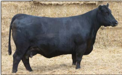
JC BLACKBIRD 7530 2572 – Maternal sister to Lot 8.