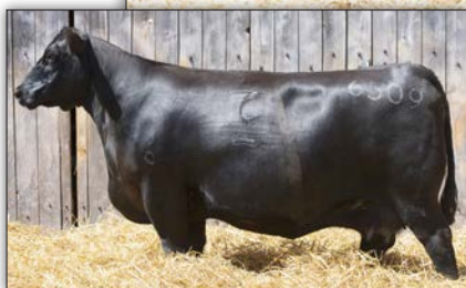
JC DONNA 6509 0561 – Maternal sister to Lot 14.