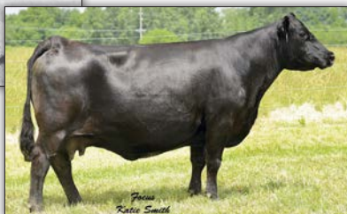
SINCLAIR ERISKAY 2C11 7883 – Third dam of Lot 2.