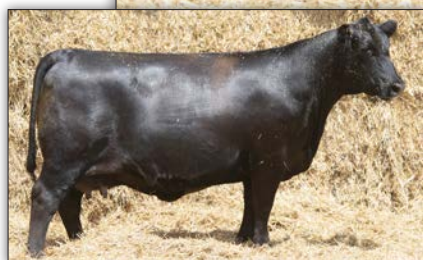
CLARK DORINDA 9575 0549 – Maternal sister to Lot 4.