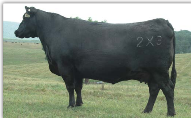
SINCLAIR ENCHANTRESS 2X3 X412 – Grandam of Lot 22.