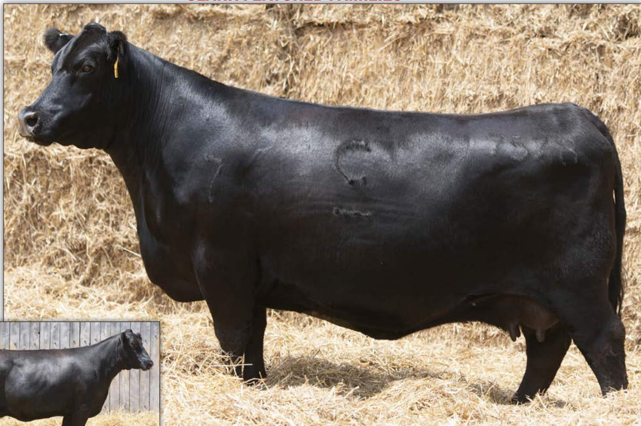
JC ROSE 7578 7008 – Lot 22