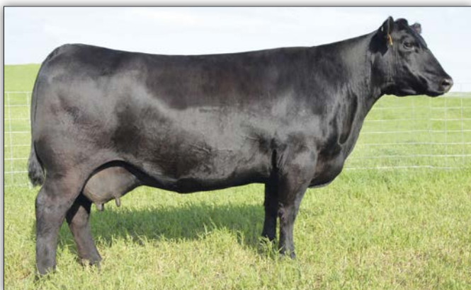
SAV BLACKCAP MAY 4136 – World-record income-producing grandam of Lot 1.