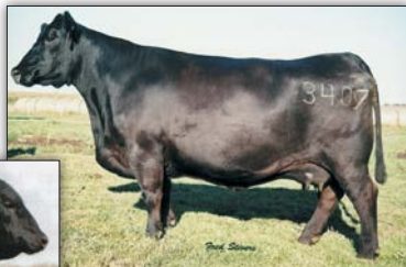
RITO 707 OF IDEAL 3407 7075 – Maternal brother to the third dam of Lot 7.

IDEAL 3407 OF 1418 076 – Legendary fourth dam of Lot 7.