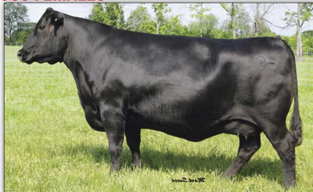
SINCLAIR LADY 1C8 4465 – Third dam of Lots 25 and 26.