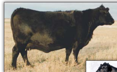
EE 4286 OF IDEAL 2240 1254 – Maternal ancestress of Lot 8 and Lot 9.