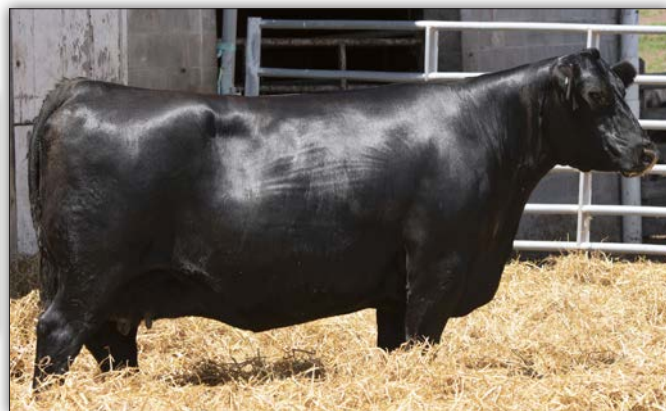
CLARK BLACKBIRD 6524 7048 – Paternal sister and from the same family as Lot 6.