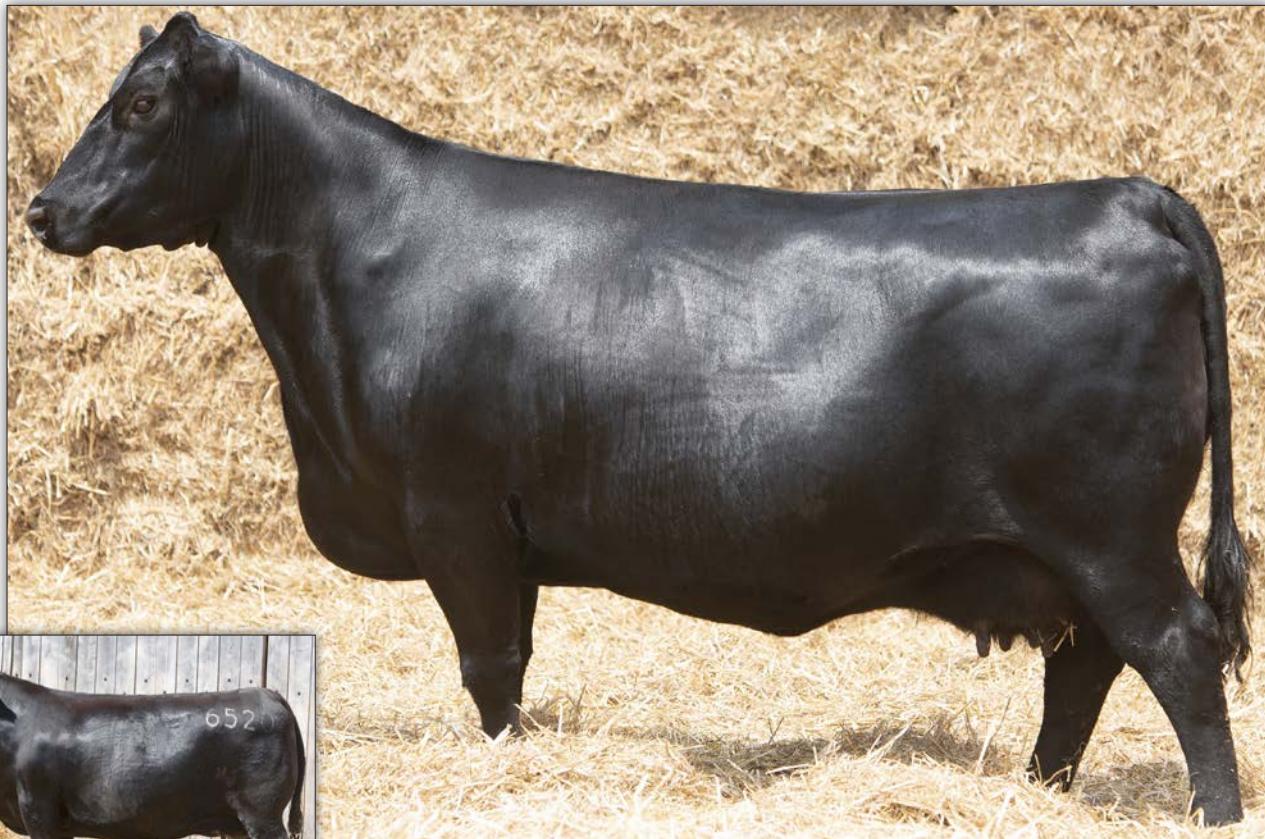
CLARK DONNA 8556 6Y3 – Lot 13