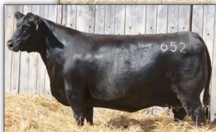
JC DONNA 6520 9018 – Dam of Lot 15 and full sister to the dam of Lot 16.