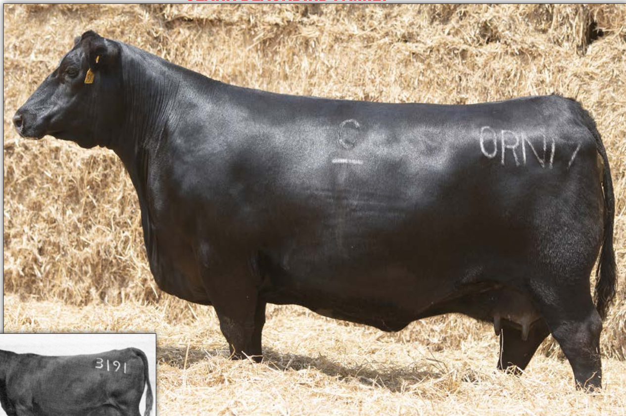
CLARK BLACKBIRD ORN17 1583 – Lot 6