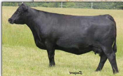
DOUBLE R BAR ERISKAY Z194 – Grandam of Lot 2.