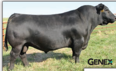
SAV RESOURCE 1441 – Full brother to the dam of lot 1.