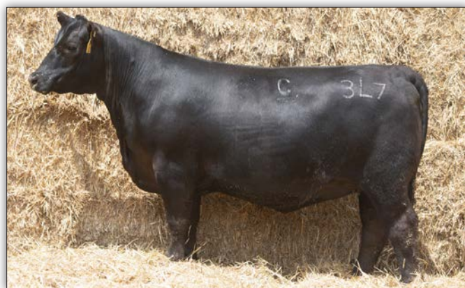
CLARK DONNA 3L7 1RN9 – Lot 16