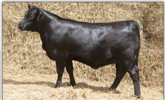
CLARK KINCHTRY BEAUTY 3RN9 – Flush sister to Lot 3.