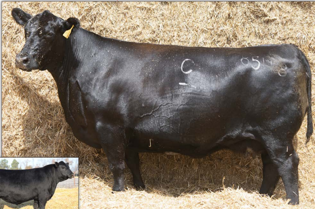
CLARK QUEEN 8548 9029 – Lot 10