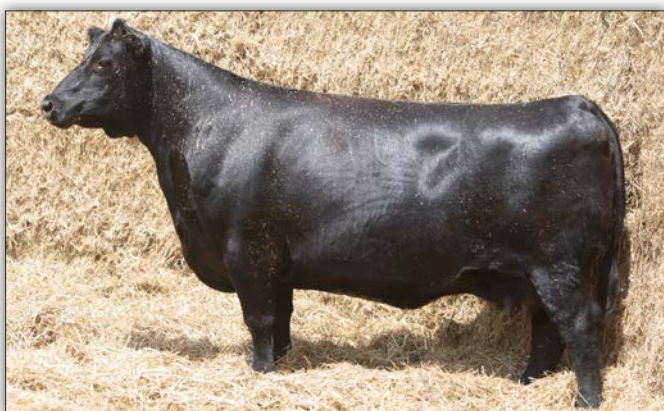
CLARK RUBY 8622 3X1 – Lot 19