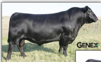
SAV 004 DENSITY 4336 – Featuring daughters of this famous Pathfinder Sire.