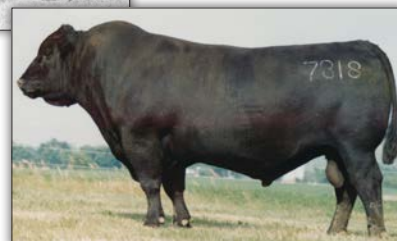
IDEAL 7318 DBL IMAGE 5002 154 – Proven sire from the herd sire producing Dorinda family.